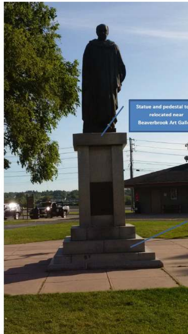
Lord Beaverbrook Statue Removal – Specification

Statue and pedestal to be relocated near Beaverbrook Art Gallery